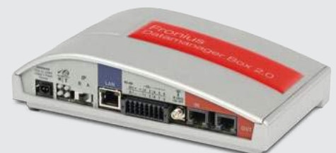
/ Fronius Datamanager Box 2.0