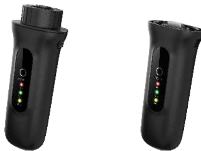
S1-W4G-ST (4 Pin)

>> Use RS485 communication method to connect the inverters, up to 10 inverters can be connected at the same time. Data communication with the monitoring system through wireless WiFi network or 4G, which can realize remote control and monitoring. The network transmits intuitive data, which is convenient for customers to monitor anytime and anywhere.