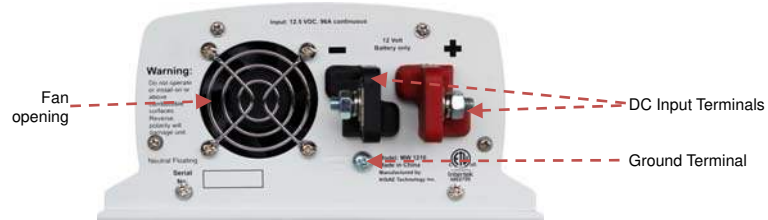
Picture shown MW1210