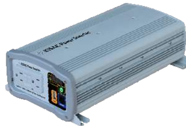
True Sinewave Series