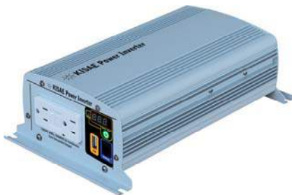
Modified Sinewave Series