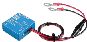
Bluetooth sensing Smart Battery Sense