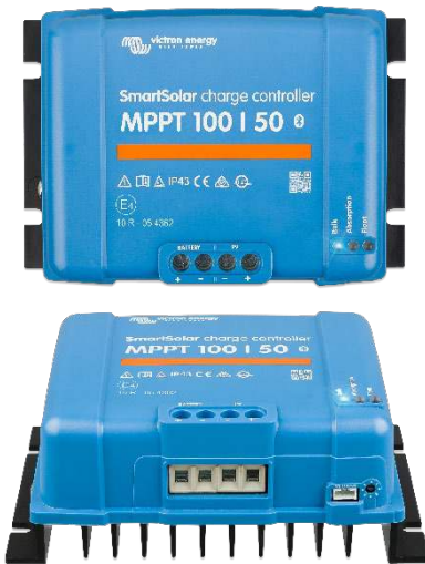
SmartSolar Charge Controller MPPT 100/50