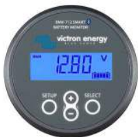
Bluetooth sensing BMV-712 Smart Battery Monitor