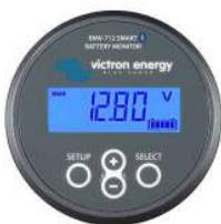
Bluetooth sensing: BMV-712 Smart Battery Monitor