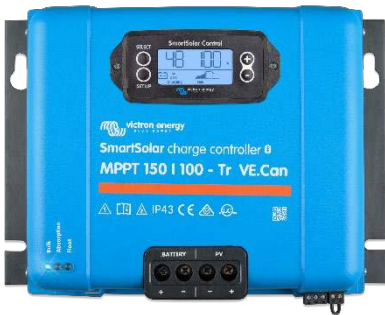
SmartSolar Charge Controller MPPT 150/100-Tr VE.Can with optional pluggable display