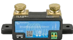
Bluetooth sensing: SmartShunt