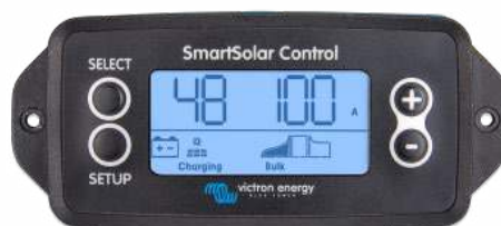
SmartSolar pluggable display