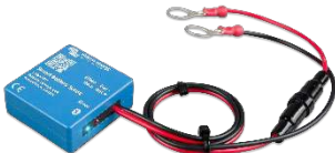
Bluetooth sensing: Smart Battery Sense