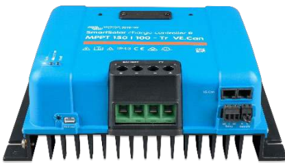
SmartSolar Charge Controller MPPT 150/100-Tr VE.Can without display