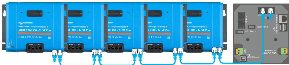
With VE.Can up to 25 Charge Controllers can be daisy-chained and connected to a Color Control GX or other GX device Each Controller can be monitored individually, for example on a Color Control GX and on the VRM website