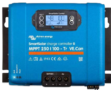
SmartSolar Charge Controller MPPT 250/100-Tr VE.Can with optional pluggable display