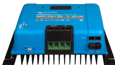
SmartSolar Charge Controller MPPT 250/100-Tr VE.Can without display