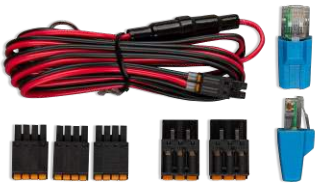
Accessories included with the Cerbo GX