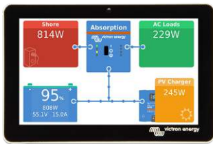
GX Touch (optional display for Cerbo GX and Cerbo-S GX)