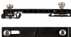
DIN35 adapter small DIN-Rail adapter to easily mount a device on a DIN-Rail. Suitable for the Cerbo GX.