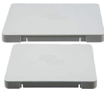
GX Touch 50 & 70 protective plastic cover (not for the Flush model)