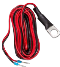
Temperature sensor for Quattro, MultiPlus and GX Device (such as the Cerbo GX)