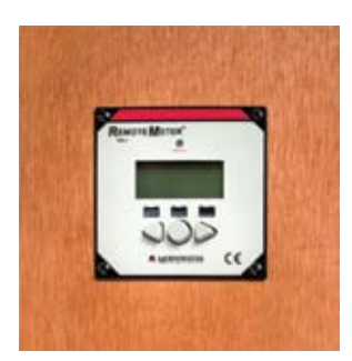
In Wall Mount