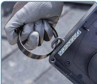
1A. Attach the SS Clamps to the Junction Box. Pro Tip: Compress the SS Clamps against the back wall and rock into place.