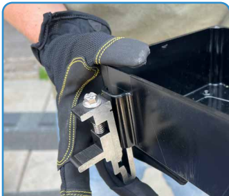
1B. Attach Panel Mount Clamps to the Junction Box. Slide clamps up until you hear/ feel a click.