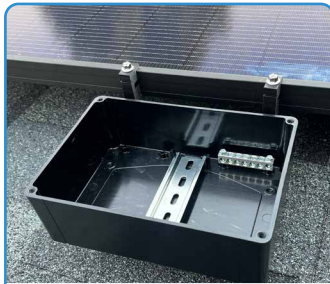
2B. Slide junction box onto module at desired location.