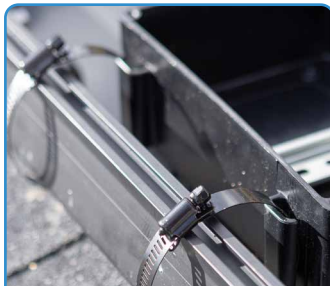
2A. Slide junction box onto the rail at desired location and secure the box with the SS Clamps. Let the JB-3 lay on the roof with the hex head rotated to the top.