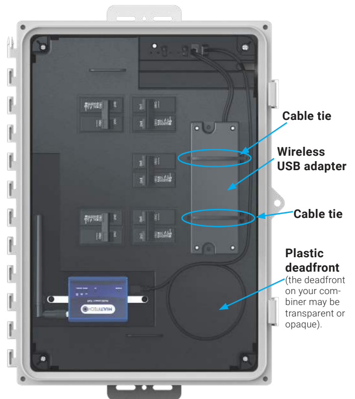
IQ Combiner 3C-ES with Ensemble Communications Kit installed