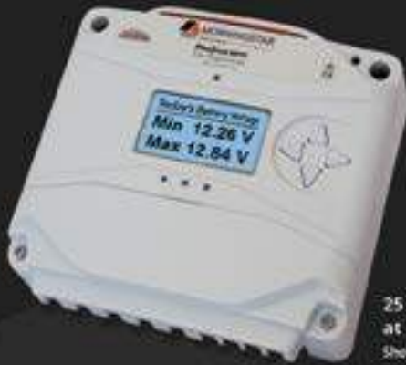
25 or 40 amp versions at up to 120 VOC Shown with optional meter

The ProStar MPPT solar controller is an advanced maximum power point tracking (MPPT) battery charger for off-grid photovoltaic (PV) systems with PV array max power (Pmp) up to 1400 watts. All versions have TrakStar™ Technology and include load control. The controller allows multiple modules in series for 12V and 24V battery systems. Detailed battery programming options allow for advanced battery support for the latest Lithium, Nickel Cadmium, and Lead Acid battery types.