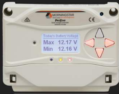
ProStar (Gen 3) Shown with optional meter