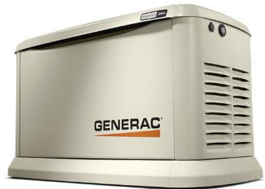
Product shown with optional fascia kit