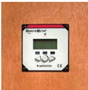
In Wall Mount